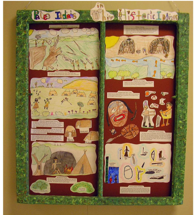
Early Native Americans in Ohio