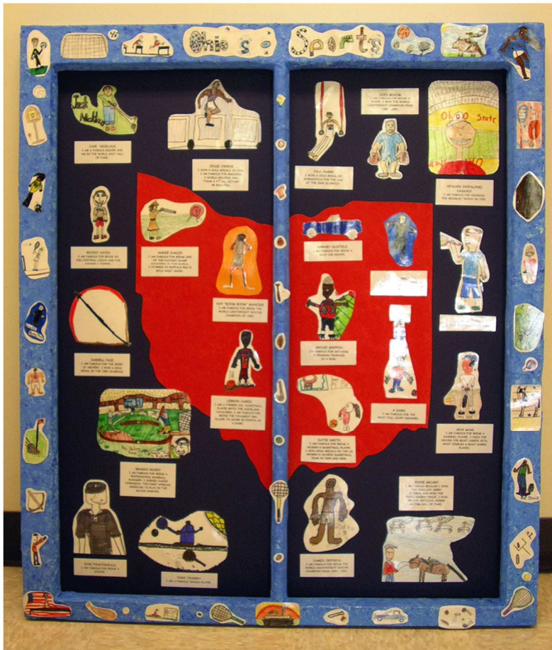
Sports in Ohio