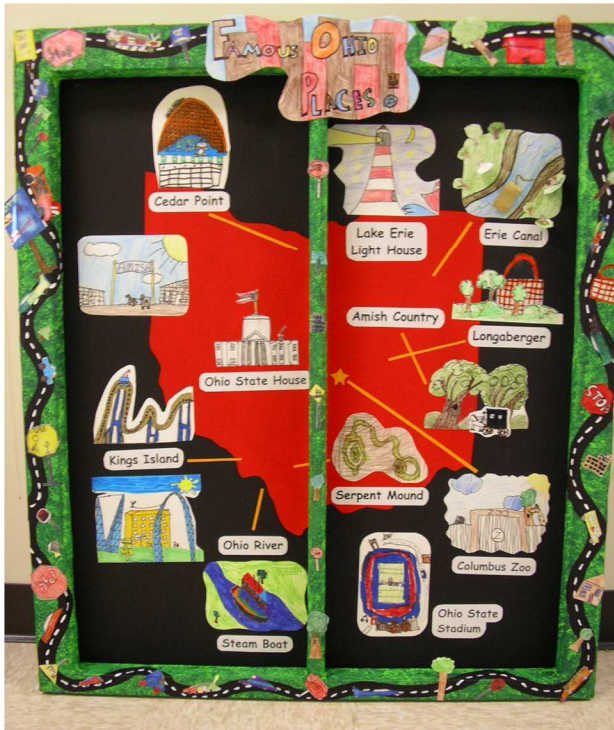
Famous Places in Ohio

The 4th grade teachers wanted to do a project focused on Ohio History, which was the Social Studies curriculum for the year. I worked with each of the 4th grade classes to develop an Ohio History theme for each window (each class worked collaboratively on their own window). Teachers provided books and on-line materials for student research during "project work times" during the week. I came in to supervise the development of initial idea sketches and final artwork, and provided materials. I had the glass removed from six old wooden window frames. Students helped paper mache, paint and decorate the frames in small groups with me in the hallway. I laminated the final art pieces and students decided on the layout of their windows. The windows were installed along a wall in the hallway near the 4th grade classrooms.